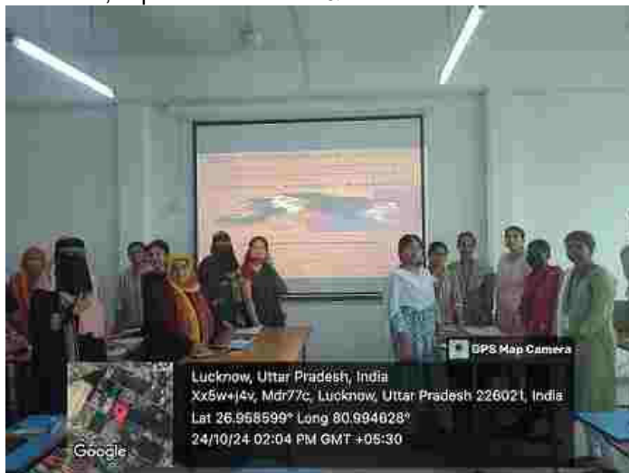
Participants involved in slogan writing.